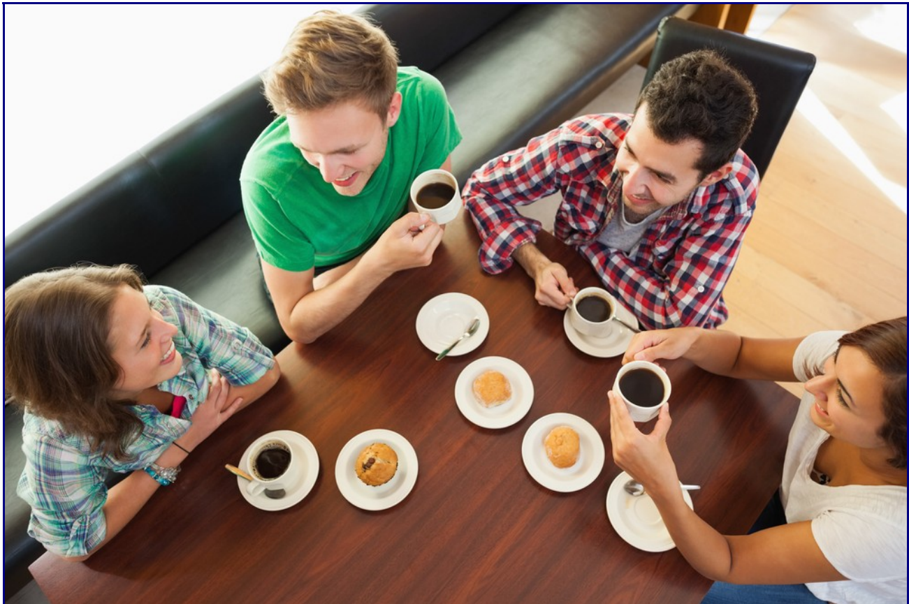
Photo: Coffee has a pH of around 5 and is therefore acidic.

If the pH of your blood rises above 7.45, the result is alkalosis. Severe alkalosis can also lead to death, but through a different mechanism; alkalosis causes all of the nerves in your body to become hypersensitive and over-excitable, often resulting in muscle spasms, nervousness, and convulsions; it's usually the convulsions that cause death in severe cases.